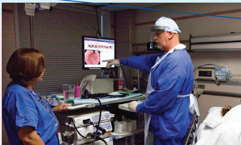
IRMC's new High Definition Endoscopy Camera offers medical staff the latest in technology to care for patients

AWARD SPONSORS 1ST FIRE & SECURITY, INC. ROSSWAY MOORE TAYLOR & SWAN S&S AIR CONDITIONING